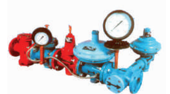
Gas Train Double Stage