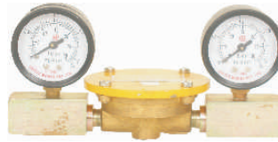
Gas Filter With Gauge