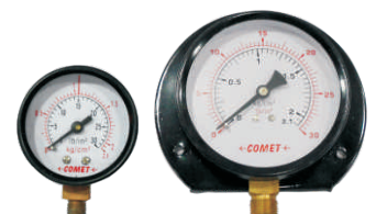
Pressure Gauges 2" & 4" Dial Available In Different Readings