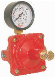
REG2-Adjustable Single Stage Regulator