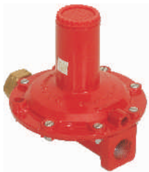
REG4-Preset 1st Stage Regulator