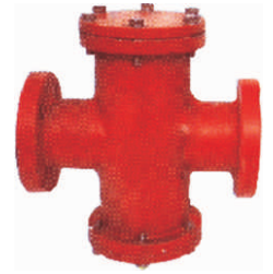
Gas Filter Flanged -High Flow