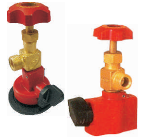
Multi Lock Adapter With NCV Double Lock Adapter With NCV