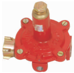
REG3-Adjustable Single Stage Regulator