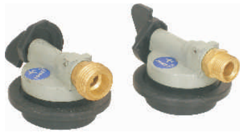
Multi Lock S.C. Adapter