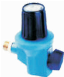
Single Lock Adjustable Regulator For S.C.Valve