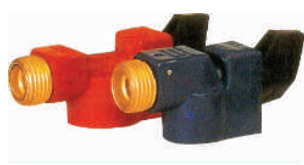
Single Lock S.C. Adapter