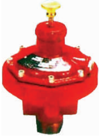
Slam Shut-Off Valve (OPSO)