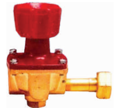
R2202-Adjustable Single Stage Regulator