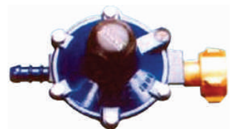
Domestic Regulator/ High to Low Pressure