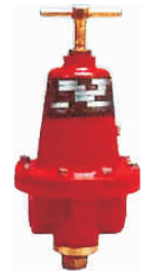
R2301-Adjustable Regulator With Gauge