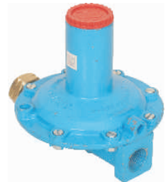
REG4B-Preset 2nd Stage Regulator