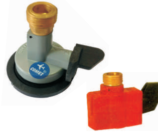
Multi Lock S.C. Adapter Vertical Double Lock S.C. Adapter Vertical