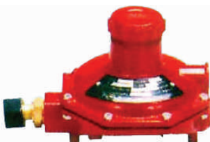
R4109-Preset 1st Stage Regulator