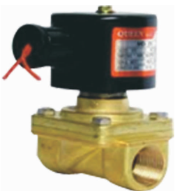
Gas Solenoid Switches/Valves