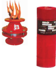
Flame Arrestor Flange End Flame Arrestor Screw End