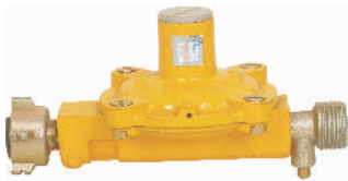
REG5- Under Pressure Shut Of Valve(UPSO)