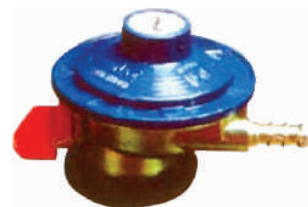
Domestic Regulator For Private Oil Companies