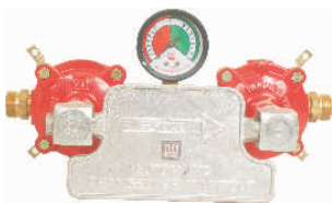
ACM3-Auotamation Change Over -Low Flow