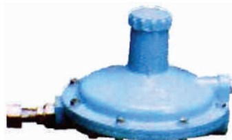
R4110-Preset 1st Stage Regulator[DP-Low Pressure]