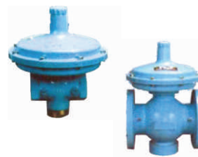
Preset Regulator Low Pressure & High Flow Preset Regulator Flanged Low Pressure & High Flow