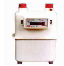
Gas Flow Meter- Commercial & Domestic