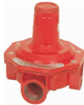
REG9-Preset 1st Stage Regulator -High Flow