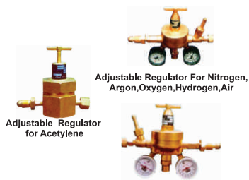
Adjustable Regulator For Nitrogen, Argon, Oxygen, Hydrogen, Air Adjustable Regulator for Acetylene Adjustable Regulator For Nitrogen, Argon, Oxygen, Hydrogen, Air