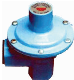
Domestic Meter Regulator