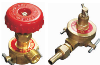
Brass Adjustable Regulator [2 Keys] Brass Adjustable Regulator [3 Keys]