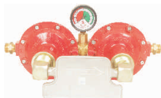
ACM4-Auotamation Change Over -Med Flow