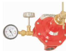
REG9G-Adjustable Regulator With Gauge