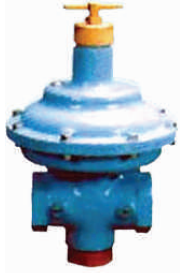
Safety Relief Valve