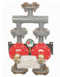
ACM9-Auotamation Change Over -High Flow