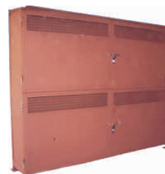
Gas Cylinder Bank