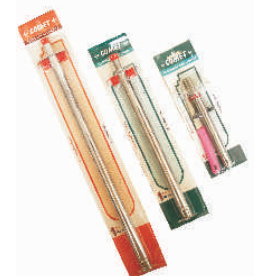
Gas Lighter -18"/12"/Domestic